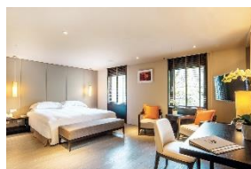
楓林客房 Fenglin Room