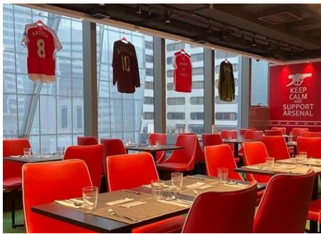
於足球主題餐廳享用豐富西餐作午餐 Enjoy Western lunch at football themed restaurant