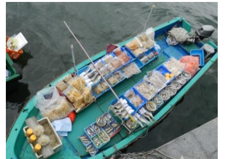
於西貢特色水上市集自由選購新鮮海產。 Buy fresh seafood home at the very unique and colorful floating market.