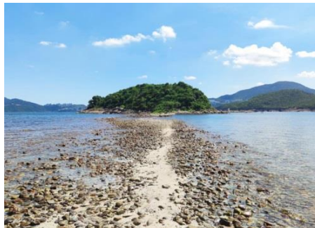
退潮的時候，在連島沙洲上戲水或觀賞這有趣的海岸地形 Catch low tide, have a walk to Kiu Tau and enjoy this interesting tombolo at the sea.