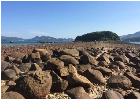
在橋咀島探索受海水侵蝕而形成不同形狀的巨石和自然美景 Spend your time exploring different shape of boulders natural beauty at the Sharp Island!