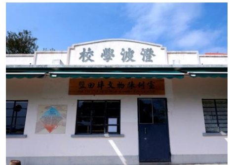
前身是澄波學校的展覽館，展出昔日的陶瓷製品、家居日用品，了解在地客家文化 The Heritage Exhibition Centre, the former primary school of the village, showcases the collections of artefacts