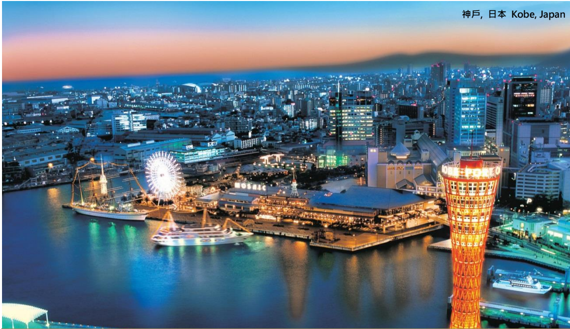
神戶, 日本 Kobe, Japan